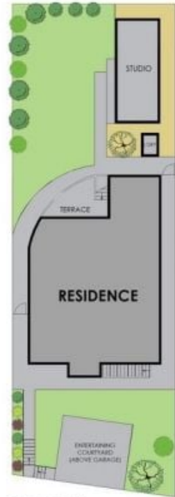
SITE PLAN not to scale